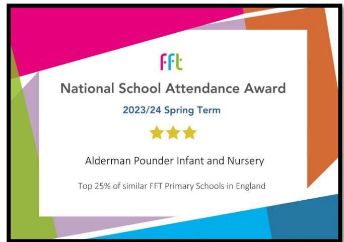
School attendance (Year to date)